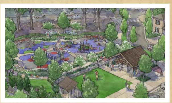
Artist Rendering of 16 Acre Site's Georgetown Park Playgroun