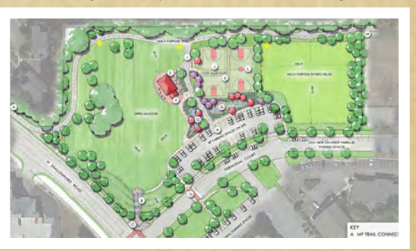
Layout for 19 Acre Site's 5 Acre Pernoshal Par