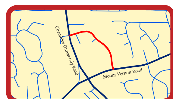
Map of Dunwoody Village Parkway

The improvements will be completed along the length of Dunwoody Village Parkway, from its southern terminus at Mount Vernon Road to its intersection with Chamblee Dunwoody Road. Dunwoody Village Parkway is indicated in red on the map at right.