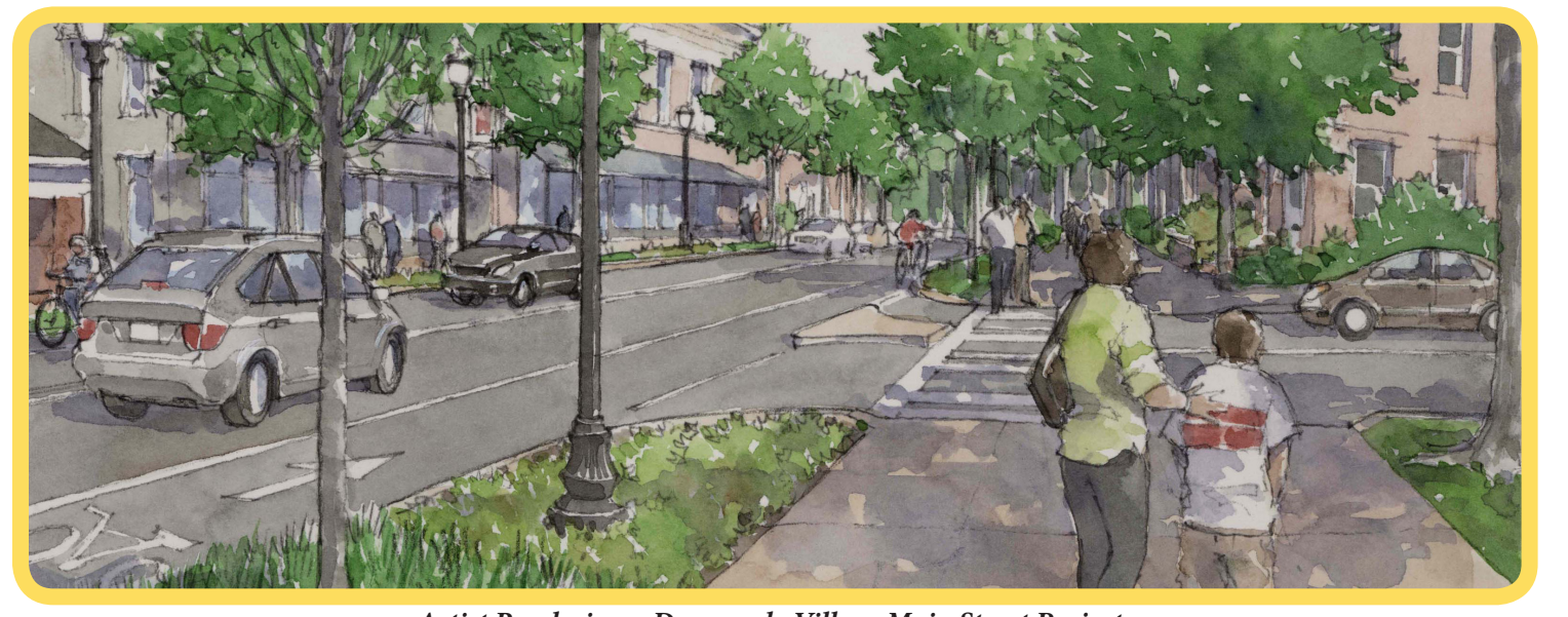
Artist Rendering - Dunwoody Village Main Street Project

City staff scheduled one-on-one meeting nearby business and property owners to help facilitate clear communications on the project's progress and establish open communication channels before construction begins. Although access will be maintained for all businesses through-out construction, the City realizes and acknowledges the potential short-term and long-term impacts this project will have on our business and property owners.