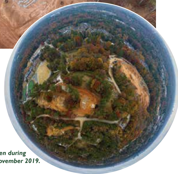
Drone photos taken during construction in November 2019.