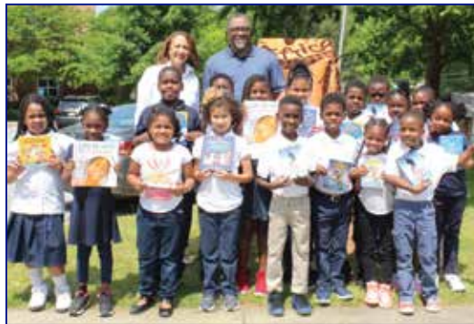
Fathers Incorporated's "Real Dads Read" program helps to fill schools and barbershops with books.