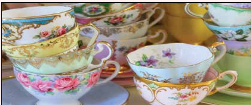
The Donaldson-Bannister Farmhouse was built circa 1870 — making it 150 years old in 2020. A city park managed by the Dunwoody Preservation Trust, the property will celebrate its sesquicentennial with a year-long celebration commencing in January and including a Sesquicentennial Tea on March 1.