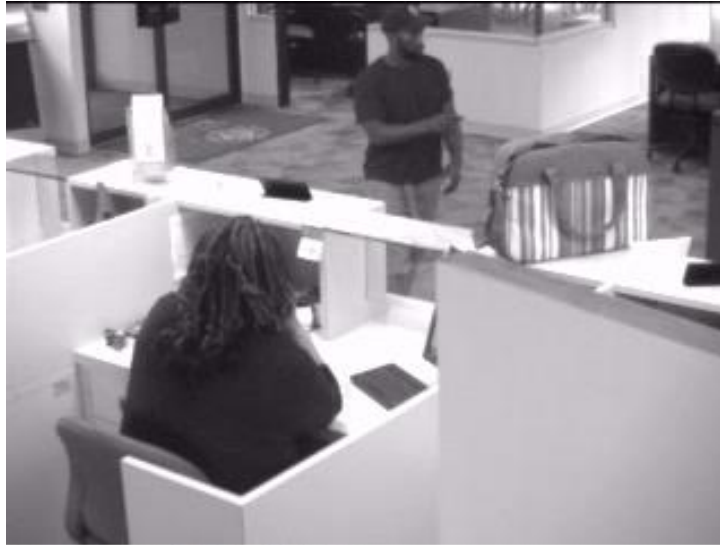
06/18/2016 11:21:40.65 Teller 3 Surveillance Fidelity-Bank-112