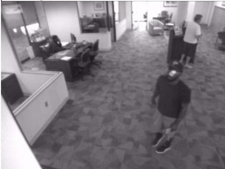
06/18/2016 11:23:48.15 Front Door Surveillance Fidelity-Bank-112